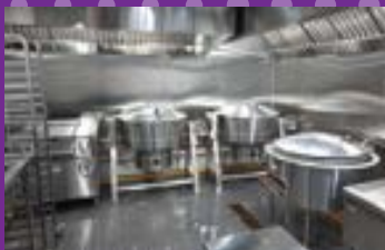
CULINARY SIMULATION AREA