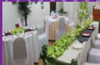
DINING SIMULATION ROOM