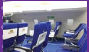
CABIN CREW SIMULATION ROOM