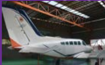
NBUC AEROPLANE HANGAR